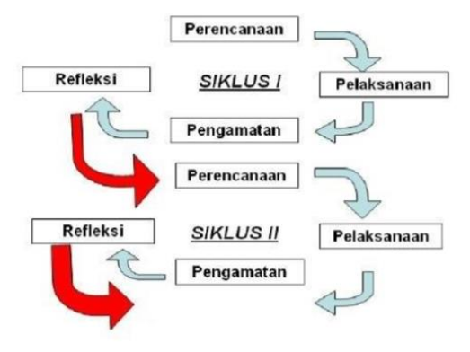
Figure 1. Stages of the Research Cycle

In alignment with the above explanation, the researcher conducted the CAR process across two cycles.