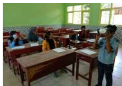
Figure 8. Practical Student

The learning process is carried out in the midst of the Covid-19 pandemic so researchers must implement health protocols with a limited number of students and keep their distance. From the results of interviews during the learning process, students felt enthusiastic and happy because they had never tried VR media in the Indonesian