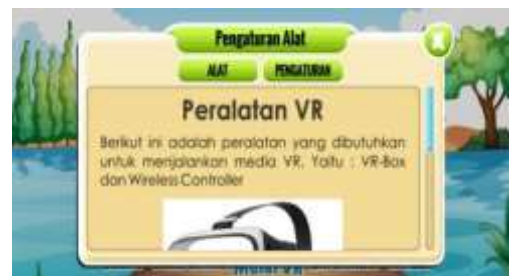
Figure 2. VR box