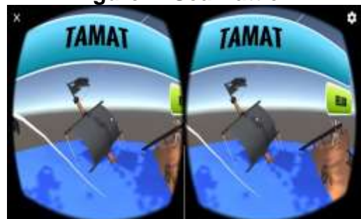
Figure 6. And of Story

One fascinating aspect of the story involves maritime events, specifically the account of the assault on the Chinese naval fleet led by Admiral Sam Po Tua Lang, also known as Dampo Abang. The battle unfolded along the coastline, with Jokotole