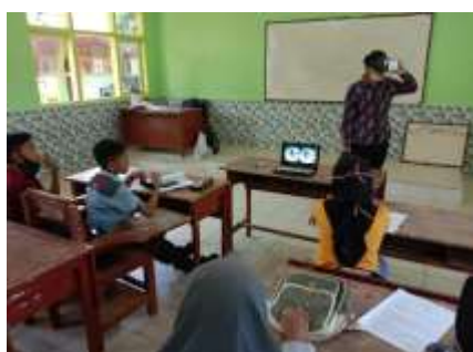
Figure 7. Trial Process

The process of learning literature is integrated through learning to read to test the ability of VR media in learning Indonesian. The process of implementing the learning went well and with the feedback in the form of interviews with students and teachers who stated that they were very enthusiastic and happy with the VR Jokotole A War mediation. This is because VR media can be an alternative medium for learning literature, especially reading in the midst of the Covid-19 pandemic. The trial was carried out at SMP Negeri 1 Pasean Pamekasan with limited students because they had to implement health protocols. The implementation of VR Jokotole A War learning can be described as follows.