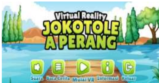
Figure 1. Initial View

Jokotole A War Virtual Reality Display. Media is displayed as needed and filtered according to start and center views. The contents are as follows.