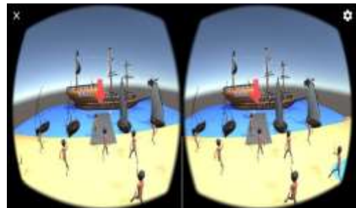
Figure 4. Sea Battle