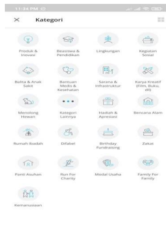
Figure 3: Donation Category Display

The magnitude of the impact of the pandemic on the economy is because many production and distribution activities are frozen due to Large-Scale Social Restrictions. The Ministry of Manpower noted that layoffs affected at least 3.05 million workers during the first three months of the pandemic. Not only in the formal sector, unemployment has also increased because many small entrepreneurs and informal workers cannot run their businesses during the PSBB. As a result, household consumption which has a share of 57.85% of gross domestic product (GDP) grew minus 5.51%. During that time, donations and various forms of social assistance poured in. On the Kitabisa.com platform, for example, from Rp 168.4 billion collected to date, around Rp 150 billion in donations were received during the early days of the pandemic. There is hope that the economic recovery will occur in line with the loosening of social restrictions and the government's stimulus. However, many people still need a generous helping hand. Fundraising continues. Here are some fundraising sites that are often chosen by millennials when donating.