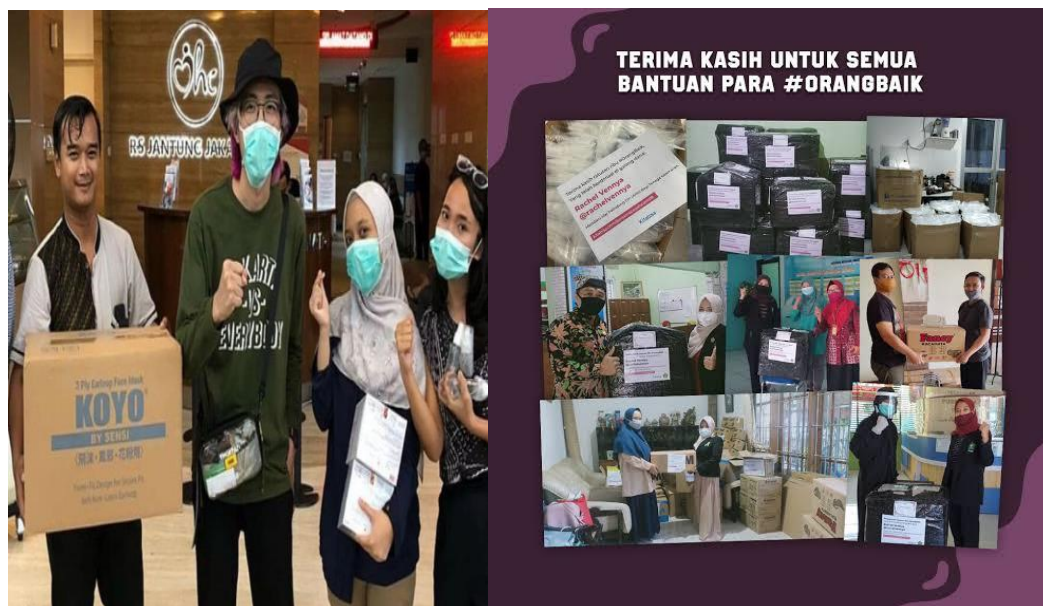
Figure 6: #OrangBaik Fund Distribution

Donations from #OrangBaik at Doctor Tirta's fundraiser have been distributed. In total, more than 199,000 PPE have been provided to 340 health facilities (hospitals and health centers). Hundreds of hospitals and health centers that have received assistance are scattered throughout Indonesia. Not only that, Doctor Tirta also distributed aid to help build a Field Hospital and other assistance for those affected by the pandemic. The struggle of the Indonesian people has not yet ended, as well as the kindness that the #Baik People have given. Solidarity to help others in need in the midst of a pandemic continues to spread and spread. We are working together to help each other fight corona. In the midst of a situation like this, everyone is struggling together, starting from the health workers and the community who help each other.