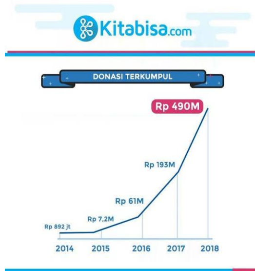
Figure 2: Kitabisa.com Fundraising Growth

From its inception until 2019, during this period we can record that we have collected donations of up to IDR 502,375,254,938 from a total of 18,402 social campaigns and presented 1,352,169 digital philanthropists. In a short period of time and is expected to increase every year. On 27 June 2019, the Kitabisa.com platform has raised Rp700 billion in funds, since its founding in 2013. Judging from the Kitabisa.com website, in more detail, the donations collected to date, Saturday, 29 June 2019 amounted to Rp752.30 billion with 27,785 number of campaigns funded. Meanwhile, the number of 'good people' who joined the crowdfunding has reached more than 2.5 million people (Eva Rianti, 2021). As a social enterprise startup, Kita can charge an administration fee of 5% of the total donations in each campaign, except for natural disaster campaigns and zakat (0% administration fees). 4 The campaign was created with an interesting caption, with a flow, and ended with an appropriate invitation to donate so as to attract the sympathy of the wider community and fellow users to do productive and charitable things through the philanthropic movement.