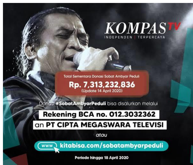
Figure 7: Charity Concert in Helping Handling Covid-19.

Apart from that, various community efforts to help those affected by the pandemic continue. Not only showing compassion, there is creativity to the use of technology in these various activities. For example the late Didi Kempot. The singer of campursari songs held a charity concert from his home on April 11, 2020. The three-hour concert which was broadcast on KompasTV managed to collect Rp 7.6 billion for the handling of Covid-19. Chief Editor of Kompas TV news channel Rosiana Silalahi stated that Didi Kempot 12 never discussed the honorarium for the concert.