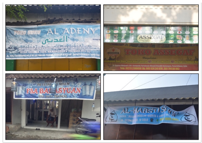
Figure 6 The Names of shops refer to surname.

In addition to the use of personal and family name, the naming process also takes the place of origin (owner and the products) or geographical area which has influence toward the business. The attachment of geographical name is commonly found in the naming model of shops not only in Pasar Kliwon but also other areas (see Figure 7). However, the geographical names are not taken from the name their ancestor origin, Hadramaut but the name of citie and area in Saudi Arabia such as Riyadh , Marwa , Al-Madinah , Asshafa , Makkah , Al-Haramain (Mecca dan Madina); Middle East country and Iran, such as: Emirat , Marakez , and Marocco Lounge .