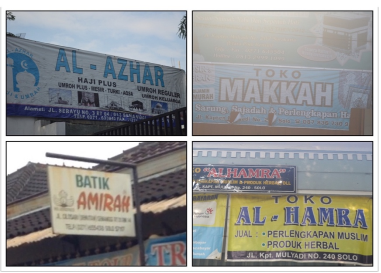
Figure 2 Name board and banner which apply Arabic name with single naming system (mononym).

In addition to the single name construction, some names which constructed with combining two words or more to be more meaningful form