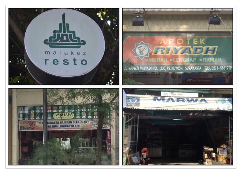
Figure 7 The Names of shops referring to geographical names.

Naming a shop is a crucial agenda and important key in developing the business. The process of naming is well-planned before determining the selected words. It means that the naming is not done randomly since it is the long-term decision in which rarely changed in the future because it will impact the market and outcome. Choosing a proper name is a strategy and persuasion technique which commonly used by the businessman to attract the consumers.