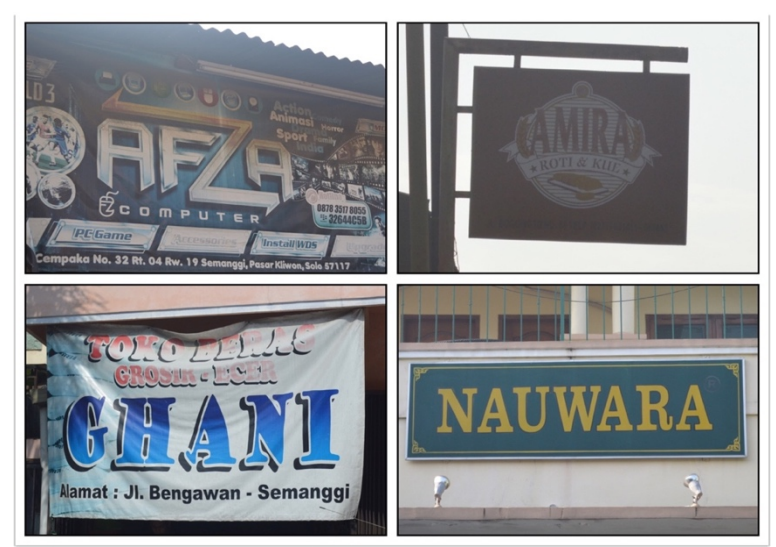
Figure 5 The names of shops refer to personal name.

Nauwara < نوبو 'rich', and Afza (< اندو 'raise') 'computer.