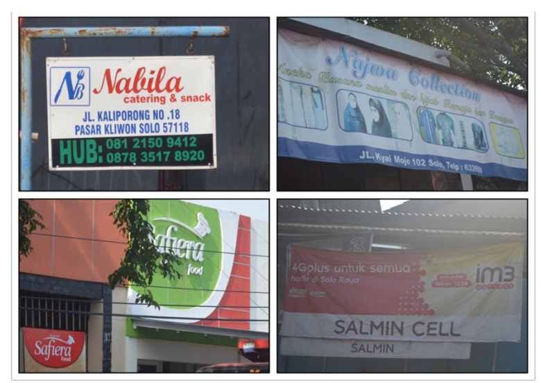
Figure 3 Name board and banner which attach Arabic with multiple naming.

is called polynym<sup>17</sup>. The names of the shop owned by the Javanese by English elements<sup>18</sup>. In fact, some shops completely adapt the English word, without any modification process. In the other hand, in case of PoAD, Arabic words is attached to the name as the primary element. The act of giving priority to Arabic element is obviously illustrated on the placement of word, which always put as the first name then followed by the English element, e.g. Salmin Cell (see Figure 3). The common combination is pictured in the bundle of Arabic as the first element and English as the second element (or last component), e.g. Najwa Collection ( Najwa < نوبون), Salmin Cell ( Salmin < روبان ), Safiera Food ( Safiera < روبان), Nabila Catering & Snack ( Nabila < روبان), and Umar Gordyn ( Umar < روبان).