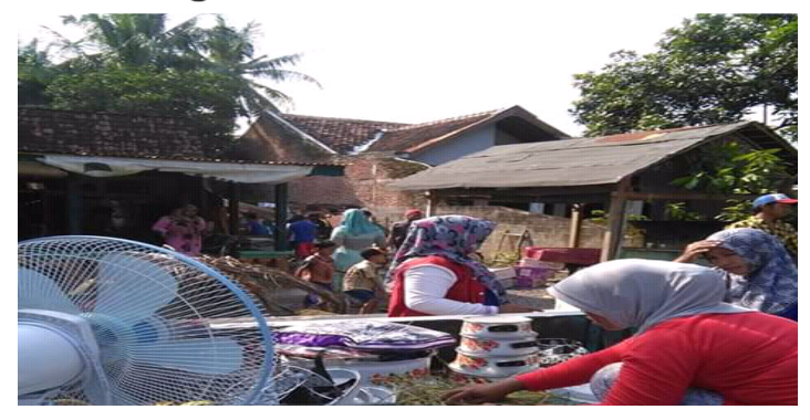
Picture 7. Direct Satire "Rèng Madhurâ mon apèsa sa Indonesia tao, èangko' kabbhi" (If Madurese people are divorced, all Indonesians know, all transported)

Reng madhure mon apesa sa indonesia tao e angkok kabbhi