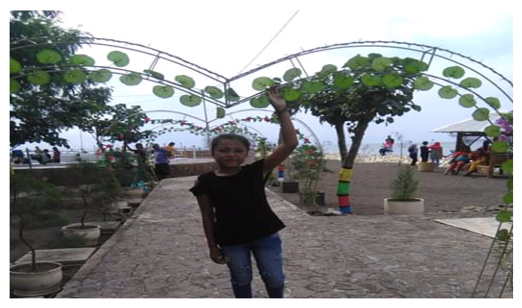
Picture 1. Mixed language Madurese-Indonesia

"Pemandangannya bagus, sayang bâceng èè" (The view is good but smelled animal waste).