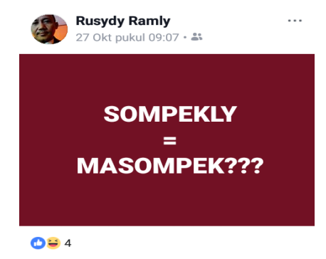
Picture 2. Mixed language Madurese - English