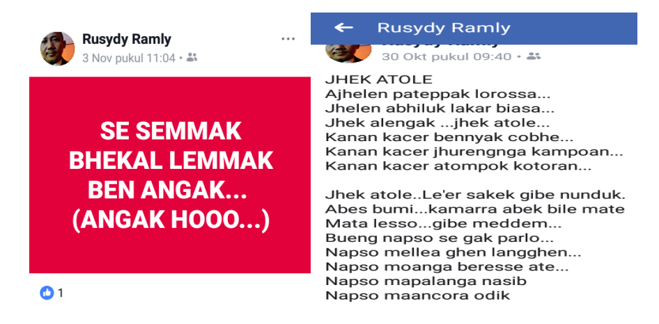
Picture 10. Lyrical and Poetic Pattern

The last criticism model is using lyrical and poetic pattern. This kind of criticism model is quite favored by Madurese people in Situbondo. Most of Situbondo people know poetic practices (papareghân). Criticism by using papareghân and poetic model is criticism model acceptable to all people. Besides linguistically beautiful, this kind of criticism model also becomes entertainment for readers. So it is often when someone writes facebook status by using this model, then it will be responded by other social media users by using the same model like expressing each other poems.