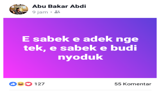
Picture 11. Dimension of Ethnic Group

It needs to explain that a user of the status is a part of Arab ethnic community in Sitibondo. Use of Madurese as criticism language in social media contains meaning that the speaker also identifies as a part of Situbondo people. Self-identification is shown by using language spoken by dominant people in Situbondo.