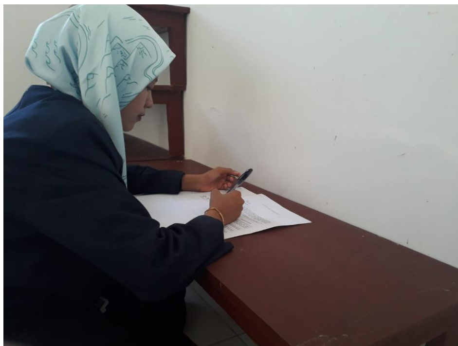
Figure 5. Reading text and filling KWL chart