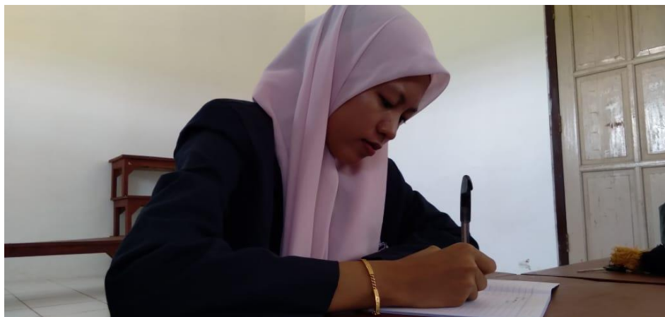
Figure 4. Filling the KWL chart